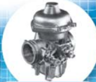
Carby Kits And Spares