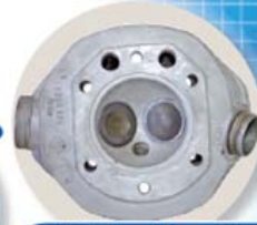
Cylinder Head Reconditioning