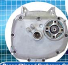
Reconditioned Exchange Gearbox