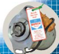
Remanufactured Ignition Trigger Unit