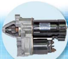
Reconditioned Exchange Valeo & Bosch Starters