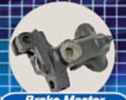
Brake Master Cylinder Resleeve