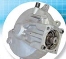
Reconditioned Exchange Final Drives