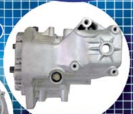
2nd Hand Gearboxes