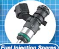
Fuel Injection Spares

Motohansa are not associated with BMW Group Australia