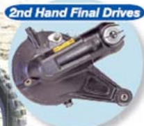
2nd Hand Final Drives