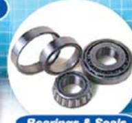
Bearings & Seals